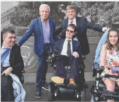
NCCDD Council Members

The Council represents North Carolinians with I/DD and is responsible for carrying out the provisions of the Developmental Disabilities Assistance and Bill of Rights Act of 2000 (DD Act). Serving up to two four-year terms, the membership is composed of 60 percent of people with I/DD or family members, with the remainder composed of representatives from state agencies, nonprofit and professional organizations. The Council guides all initiatives and contracts.