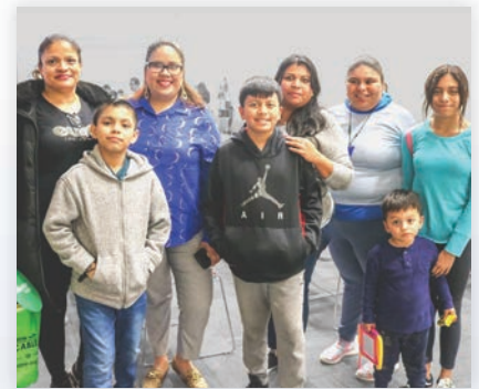
DD Network Partners