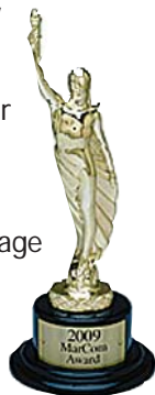
2009 MarCom Gold Award for "SELF DETERMINATION Is ..."

The COMPREHENSIVE COMMUNICATIONS PLAN got the NCCDD's message out to the public in 2008-2009. A new website design was developed, making it easier to track Council developments and issues affecting the disability community. A new approach to "people first" language was presented in a widely distributed Council brochure. The Communications initiative led efforts to gather comments on revisions to the Council's five-year plan and produced two issues of the "Catalyst for Change" newsletter, together with the annual report.