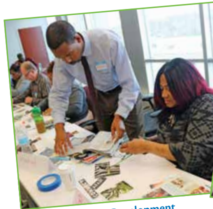
Financial Asset Development

The Five-Year Plan (2017-2021) was adopted by the 40-member Council and was approved by the Administration on Intellectual and Developmental Disabilities (AIDD). Implementation began on October 1, 2016.