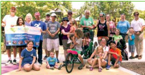
Children with disabilities and their families celebrated the ADA anniversary on the Sassafras All Children's playground.

NCCDD hosted an ADA 27th Anniversary celebration event at the Sassafras All Children's Playground in Raleigh, NC on July 23, 2017. The event welcomed families, advocates and children for a fun day in the park, celebrating the landmark law that promotes equal access for people with disabilities. The playground has been remodeled and designed to be a place for kids of all abilities to come together and play while promoting inclusion and integration for all members of the community.