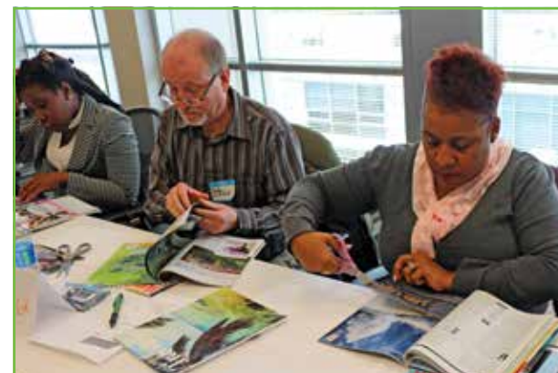
Attendees at the Train-the-Trainer workshops worked on vision boards, a tool to display goals to be achieved through financial asset development.