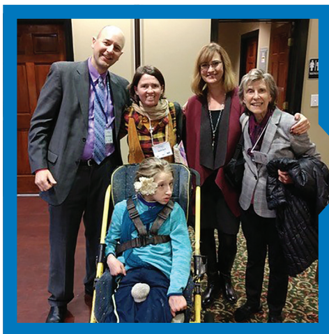
Rethinking Guardianship Summit