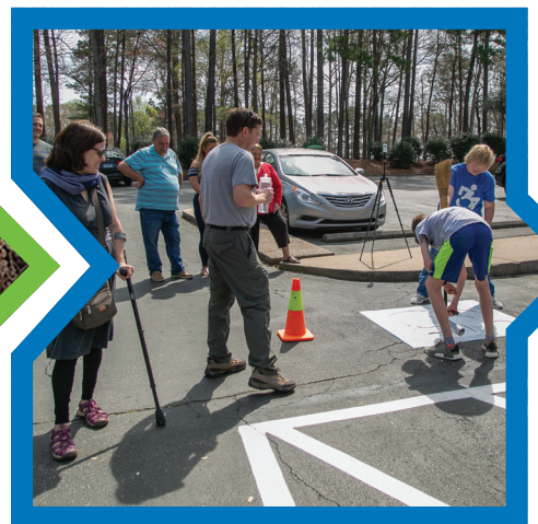
Accessible Icon Painting Project