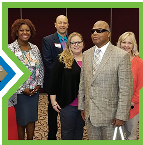
Celebrating the ADA