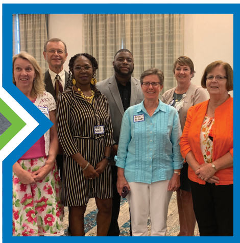
Eastern NC Disability Organizations