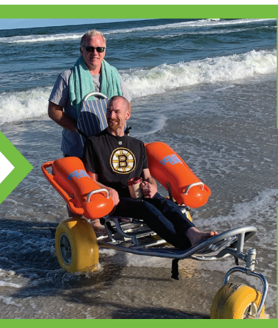
Fun at the Beach

During NCCDD's May 2019 meeting at Carolina Beach, NC, eight individuals representing eastern North Carolina disability organizations met Council members and shared information about their organizations. Representatives included Project SEARCH, NCVR, Robeson Community College, Trillium Health, disAbility Resource Center, The Arc of North Carolina, Brunswick Community College, Community Care of the Lower Cape Fear and New Hanover County Public Health.