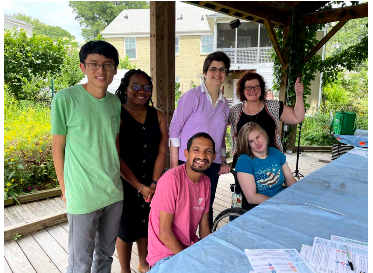
DURHAM: FIFNC Quillo Connect Authors and team discussing important topics for videos, June 2021