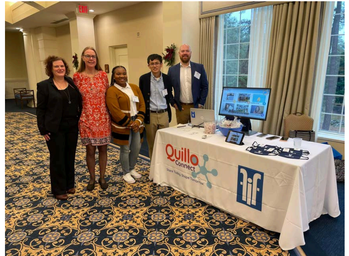
FIFNC and Quillo presented at i2i Pinehurst Conference in December 2021.